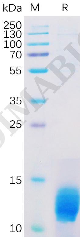
Figure 1. Human MUC1 Protein, His Tag on SDS-PAGE under reducing condition.