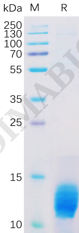
Figure 1. Human MUC1 Protein, His Tag on SDS-PAGE under reducing condition.