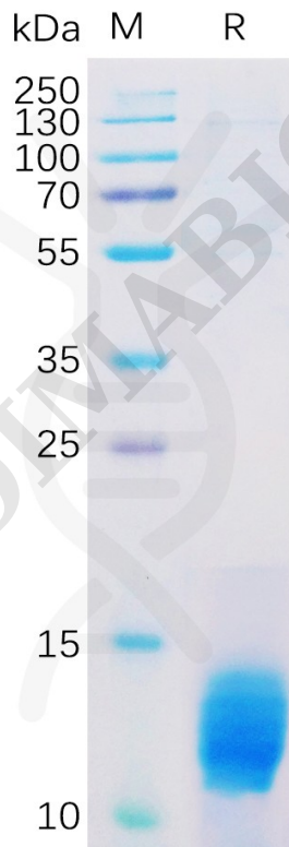
Figure 1. Human MUC1 Protein, His Tag on SDS-PAGE under reducing condition.