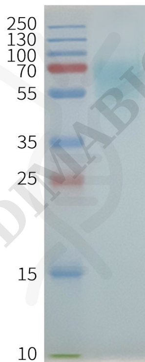
Figure 2. Human NK1R-Nanodisc, Flag Tag on SDS-PAGE