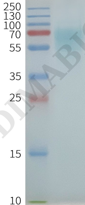
Figure 2. Human NK1R-Nanodisc, Flag Tag on SDS-PAGE