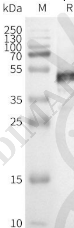
Figure2. WB analysis of Human OR1E1-Nanodisc with anti-Flag monoclonal antibody at 1/5000 dilution, followed by Goat Anti-Rabbit IgG HRP at 1/5000 dilution