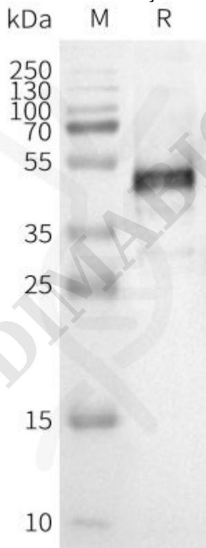
Figure2. WB analysis of Human OR1E1-Nanodisc with anti-Flag monoclonal antibody at 1/5000 dilution, followed by Goat Anti-Rabbit IgG HRP at 1/5000 dilution