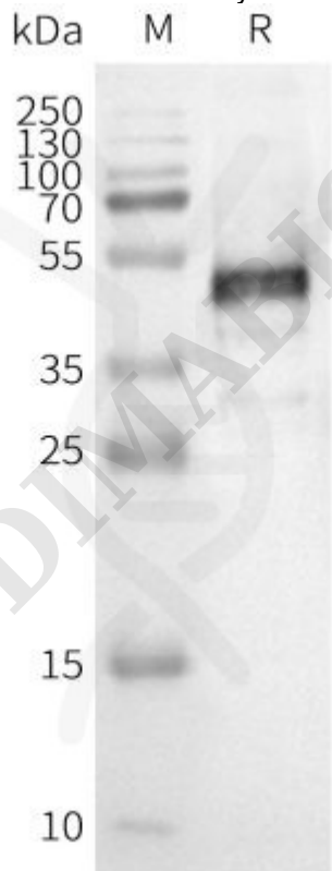
Figure2. WB analysis of Human OR1E1-Nanodisc with anti-Flag monoclonal antibody at 1/5000 dilution, followed by Goat Anti-Rabbit IgG HRP at 1/5000 dilution