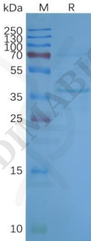
Figure2. Human OR2H1-Nanodisc, Flag Tag on SDS-PAGE