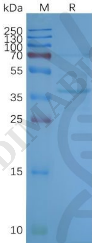
Figure2. Human OR2H1-Nanodisc, Flag Tag on SDS-PAGE