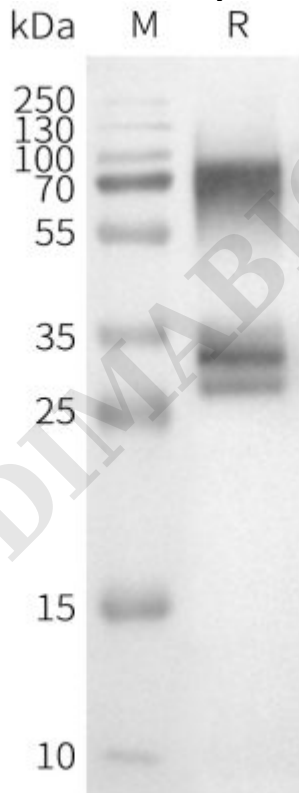
Figure2. WB analysis of Human OR3A1-Nanodisc with anti-Flag monoclonal antibody at 1/5000 dilution, followed by Goat Anti-Rabbit IgG HRP at 1/5000 dilution