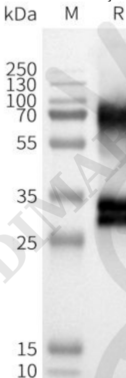
Figure2. WB analysis of Human OR52D1-Nanodisc with anti-Flag monoclonal antibody at 1/5000 dilution, followed by Goat Anti-Rabbit IgG HRP at 1/5000 dilution