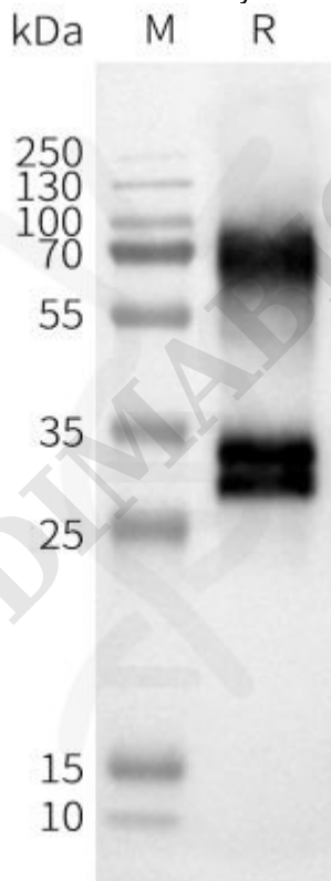
Figure2. WB analysis of Human OR52D1-Nanodisc with anti-Flag monoclonal antibody at 1/5000 dilution, followed by Goat Anti-Rabbit IgG HRP at 1/5000 dilution