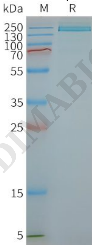
Figure2. Human PLA2R1-Nanodisc, Flag Tag on SDS-PAGE