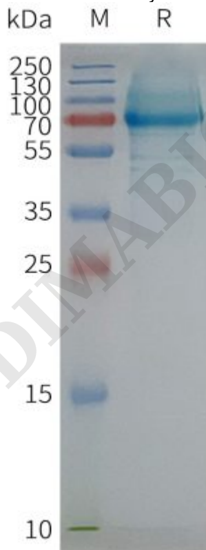
Figure2. Human SCARB1-Nanodisc, Flag Tag on SDS-PAGE