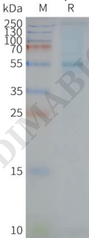
Figure2. Human STEAP2-Nanodisc, Flag Tag on SDS-PAGE