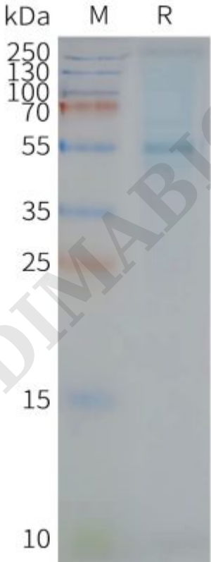
Figure2. Human STEAP2-Nanodisc, Flag Tag on SDS-PAGE