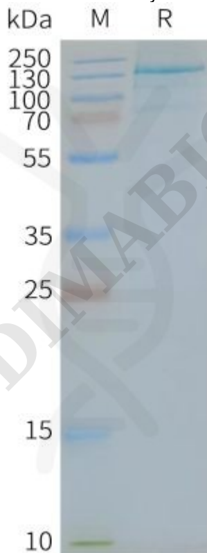
Figure2. Human TLR7-Nanodisc, Flag Tag on SDS-PAGE