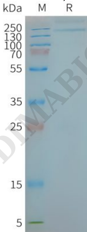
Figure2. Human TLR9-Nanodisc, Flag Tag on SDS-PAGE