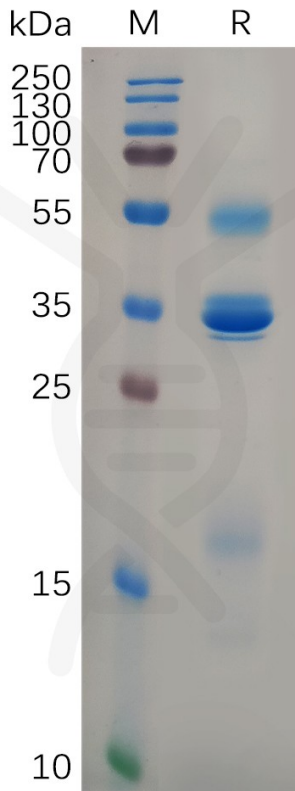
Figure 1. Human TSLP Protein, hFc Tag on SDS-PAGE under reducing condition.