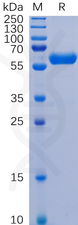
Figure 1. SARS-CoV-2 (2019-nCoV) S protein RBD, hFc Tag on SDS-PAGE under reducing condition.